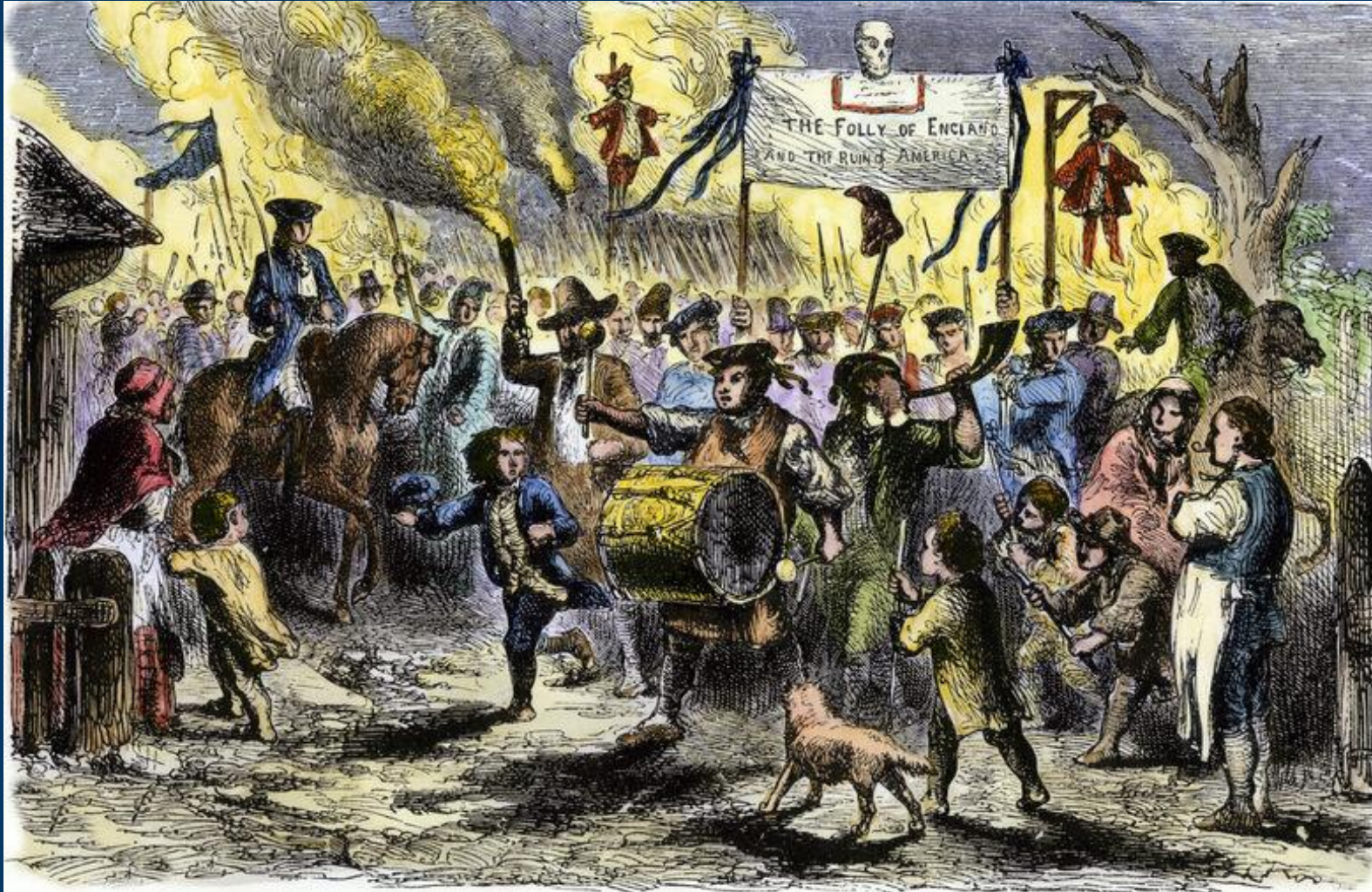
THE STAMP ACT RIOTS AT BOSTON

1) Name one of the ways the colonists reacted to the Stamp Act.